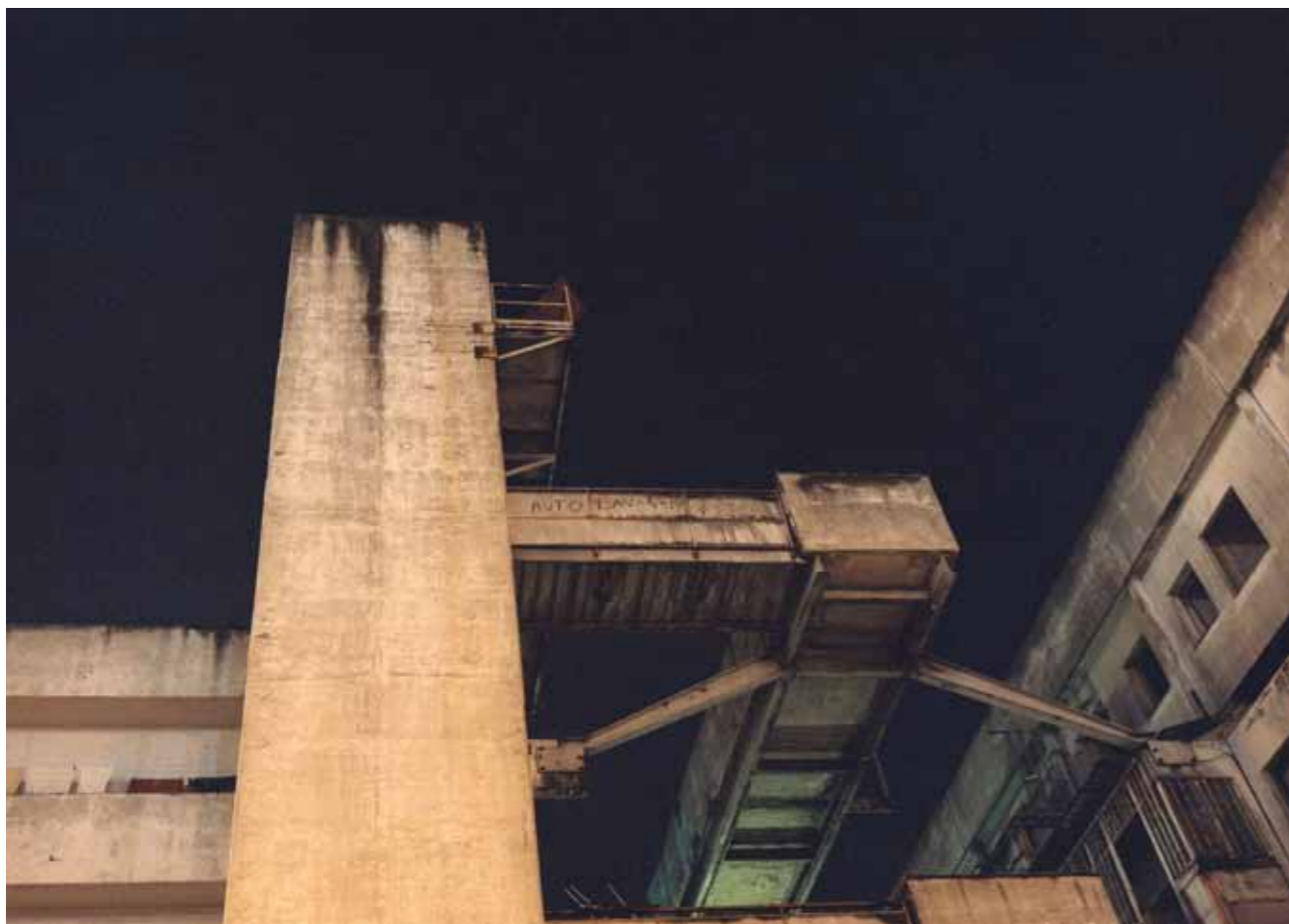
Tobias Zielony Vele, 2009–2010