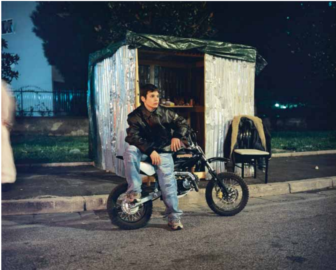
Tobias Zielony Vele, 2009–2010