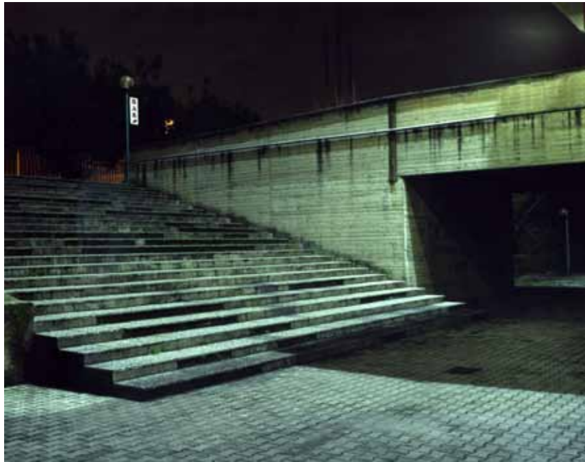
Tobias Zielony Vele, 2009–2010