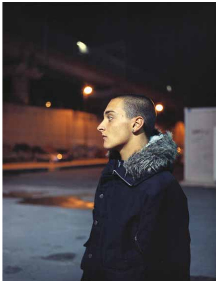
Tobias Zielony Vele, 2009–2010