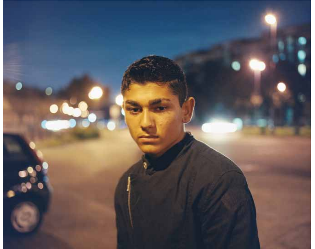
Tobias Zielony Vele, 2009–2010