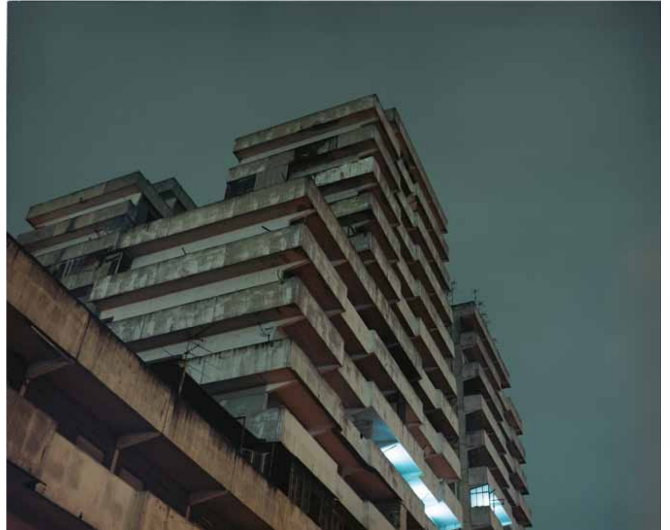
Tobias Zielony Vele, 2009–2010