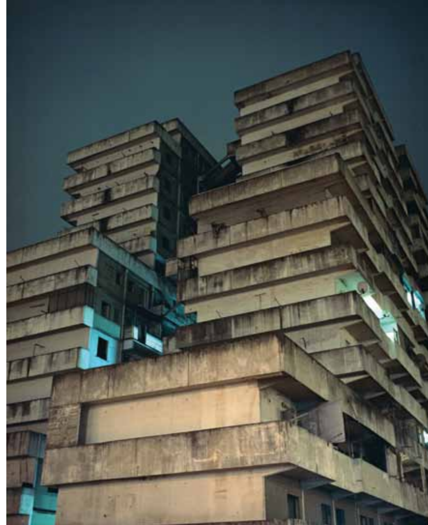
Tobias Zielony Vele, 2009–2010