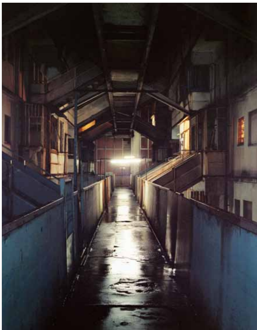
Tobias Zielony Vele, 2009–2010