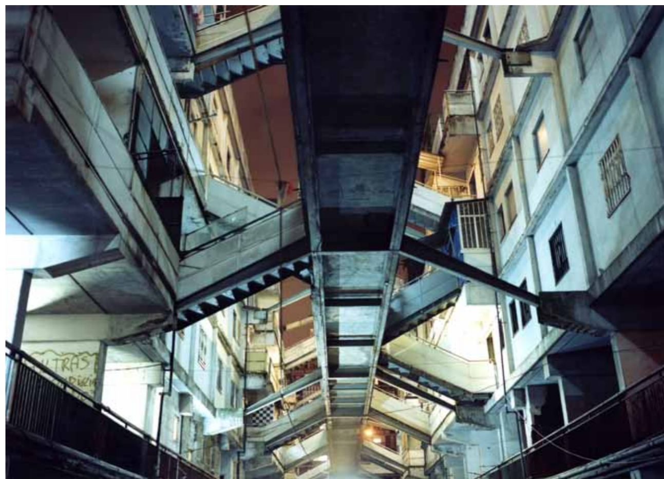
Tobias Zielony Vele, 2009–2010