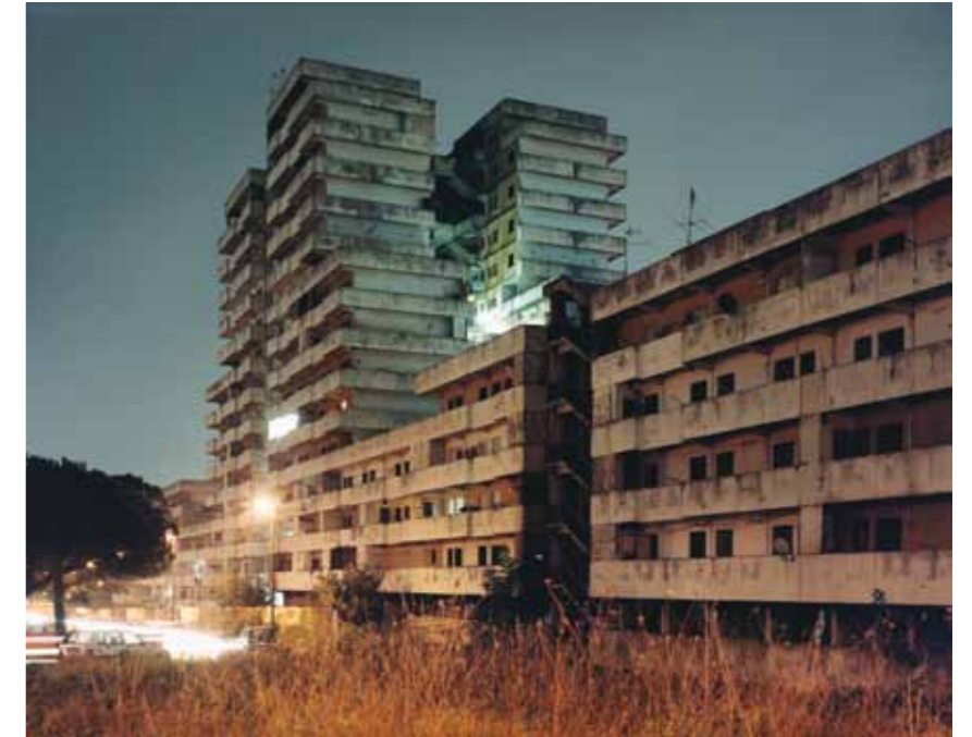
Tobias Zielony Vele, 2009–2010