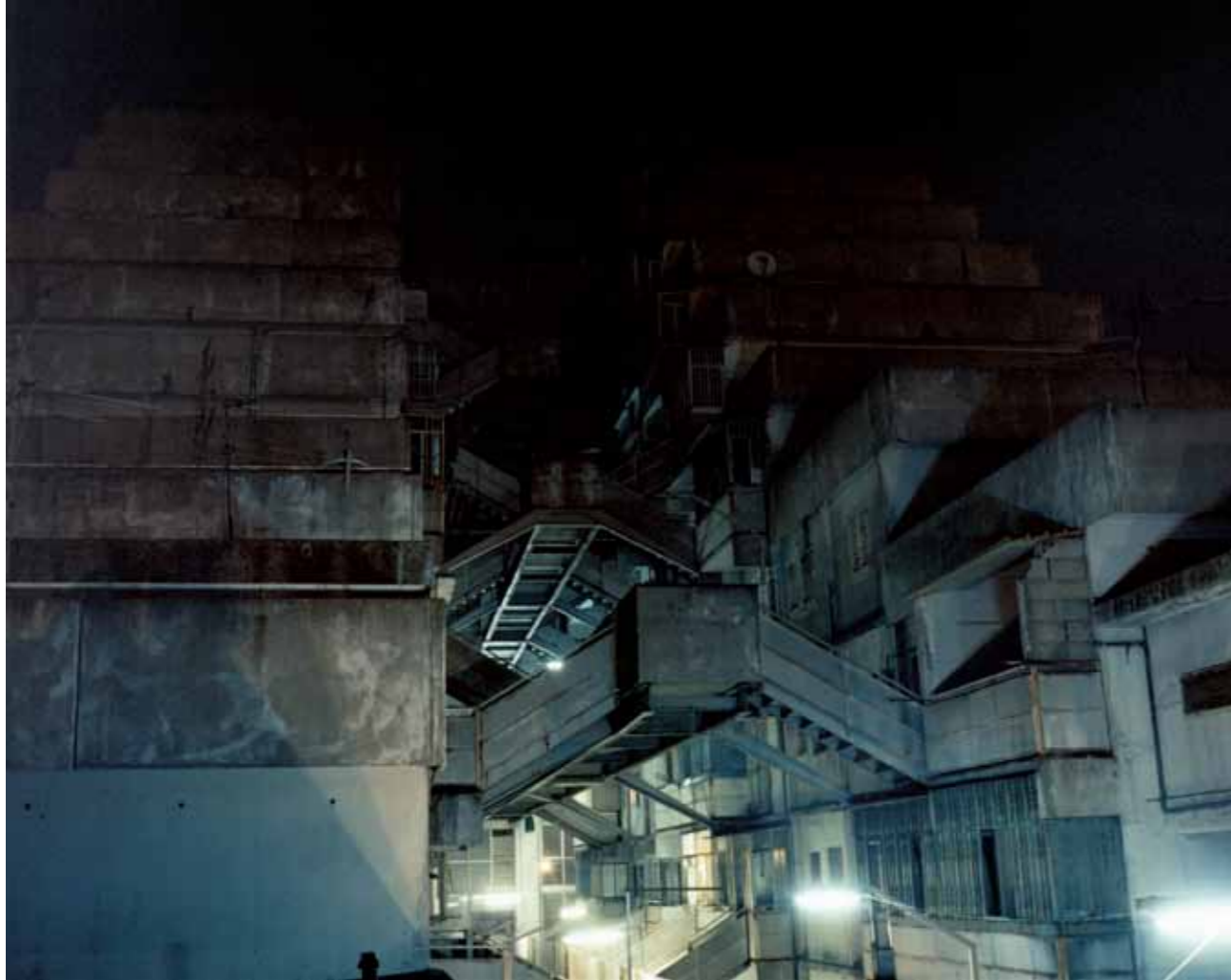
Tobias Zielony Vele, 2009–2010